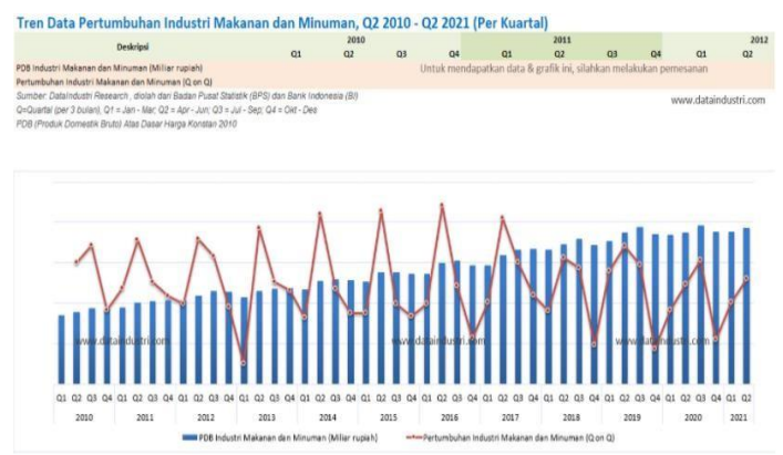
Figure 2. Food and Beverage Industry Growth Data Trends from 2010 to 2021

In total, the trend data on the growth of the food and beverage industry each year from 2010 to 2021 can be seen in Figure 1. Companies in the food and beverage sub-sector also have bright prospects in the future. This is because the need for food and drink in everyday life is excellent. Business people see this as an opportunity to provide or fulfill market needs. Consumer loyalty will be created if the market is interested in the products produced. This condition will increase profits for the company.